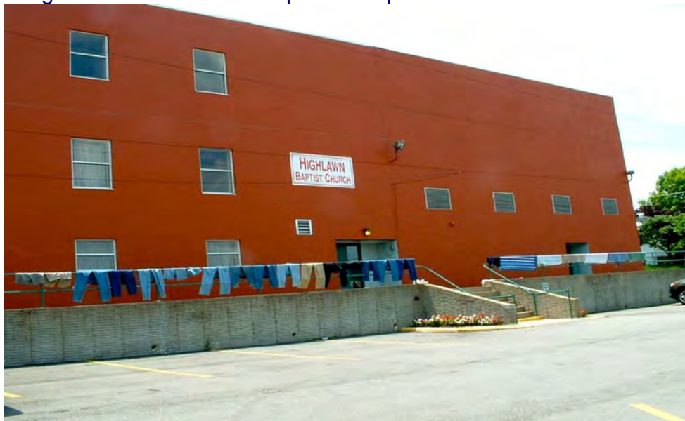
Slightly unusual site for the parking lot at Highlawn Baptist, St. Albans!