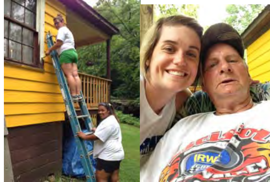
A little paint can brighten up a lot!